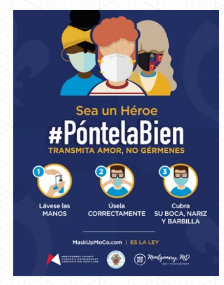
#MaskUpMoCo in seven languages