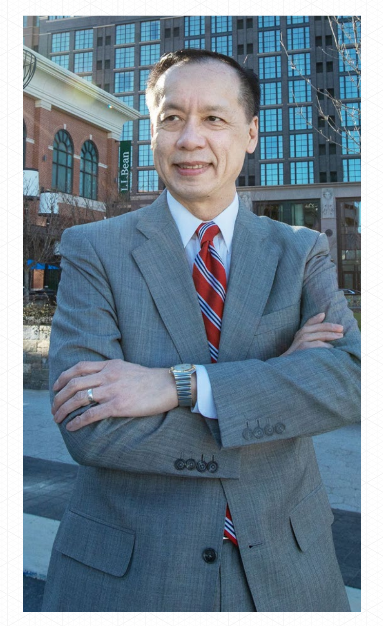
MCEDC President and CEO